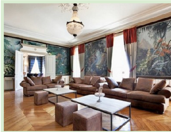
19th Century Wall Paintings in Salon at the Chateau

The Chateau is located in the village of Mercurey, which is a short stroll through the vineyards. It has traditional French style charm with all modern comforts including ensuite bathrooms, heated pool, a beautiful outdoor dining area with summer kitchen and fully equipped gym and sauna. Everyone will be able to enjoy the regional dishes prepared by our French cuisiniere Thomas, along with the wonderful wines of Burgundy and other regions of France. For those interested in French cooking Thomas(who will be preparing the evening gastronomic delights) is happy to have you work with him learning the intricacies of the French cuisine. You will share some memorable experiences with new friends.